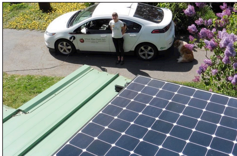
Photo: Mendocino Solar Service customer charges her electric car with power from her roof-top solar energy system. She calls it: “A win, win!”